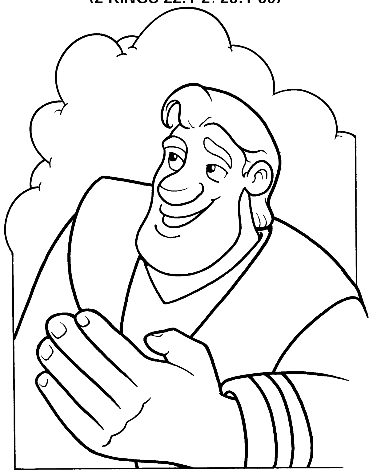
116. JOSIAH (2 KINGS 22:1-2: 23:1-30)